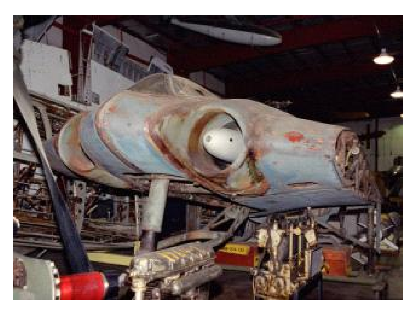
Horten Ho 229 V3 prototype at the Smithsonian's Garber restoration facility (National Air and Space Museum)