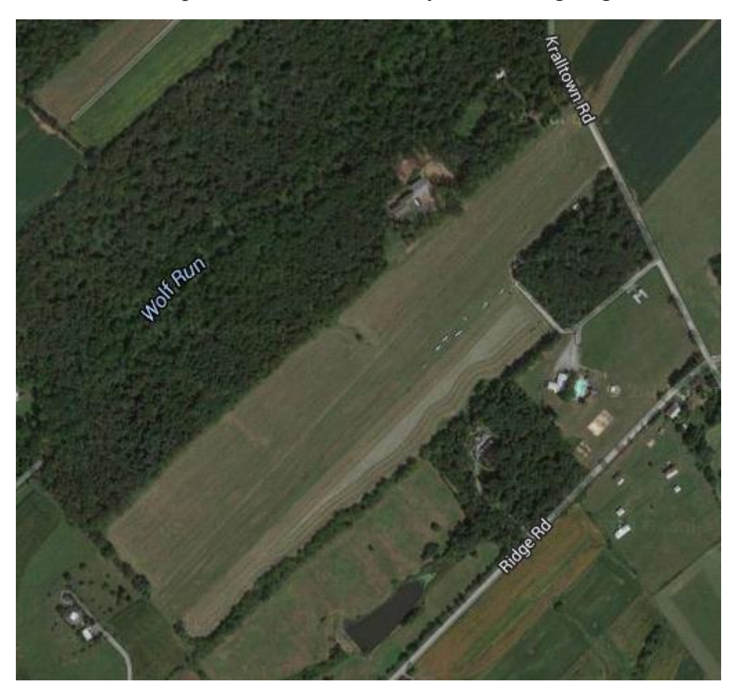
Shreveport North Airport (62PA)

Chapter 122 bracelets for the Young Eagles participants will be on hand, paid for by the 245 EAA award points earned from last year's Young Eagles events.