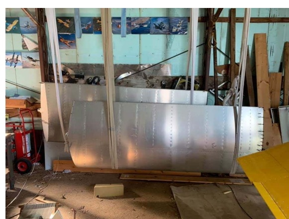
Wings ready to go.