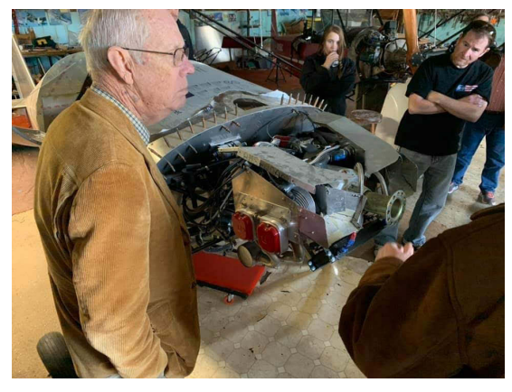
Looking over that pretty UL engine.