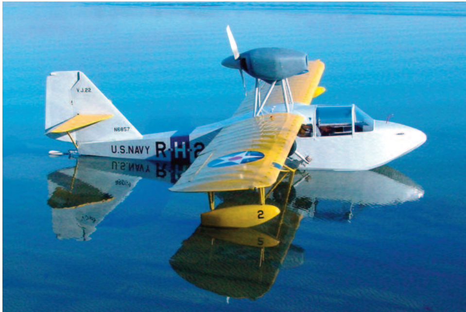
Volmer Jensen VJ22

Our Web Site: www.113.eaachapter.org EAA113@yahoogleroups.com