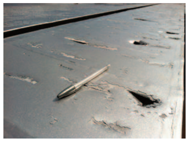
B-17 hail damage Photo shows hail damage to the top of Aluminum Overcast's right aileron.

Elliott added that the hail came straight down and punched holes in the fabric-covered control surfaces. After the initial damage assessment, the word came to get new control surfaces - ailerons and elevators (and a rudder - just in case) - shipped to Centennial as soon as possible. Fortunately, EAA has all the needed replacement parts on hand, thanks to the AirVenture fabric workshop run by EAA A&P mechanic Gary Buettner. Each year at Oshkosh, volunteers instruct attendees on stitching and covering skills, with B-17 control surfaces among the hands-on projects. After AirVenture, the covered surfaces are inspected and painted silver by EAA staff so they are ready at a moment's notice.