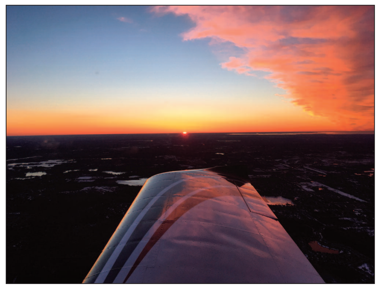
Sunrise flight