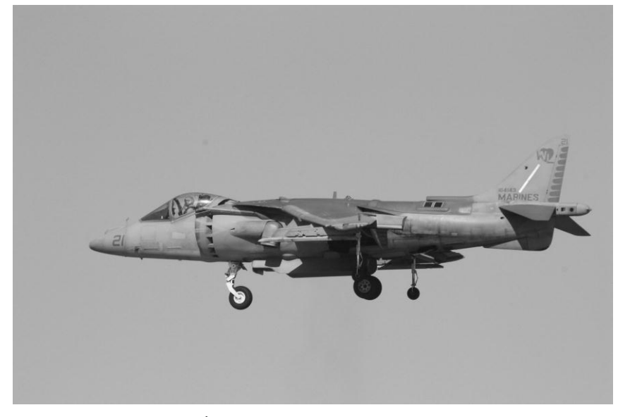
Hawker Harrier at AirVenture 2011