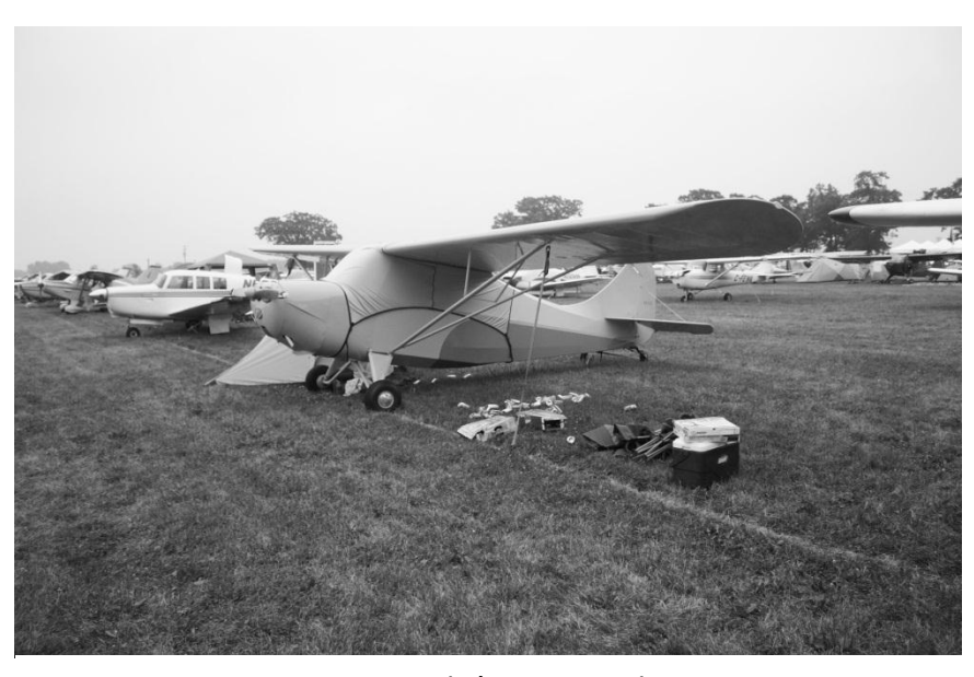
Sean Crooks' Aeronca Champ