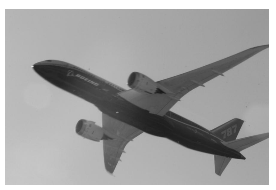
The new Boeing 787 at AirVenture 2011

Q925 – Arrange the following aircraft in the order in which they have the right of way according to part 91 of the FARs: Airplane, Airplane Towing a Glider, Balloon, Blimp, Glider, Helicopter.