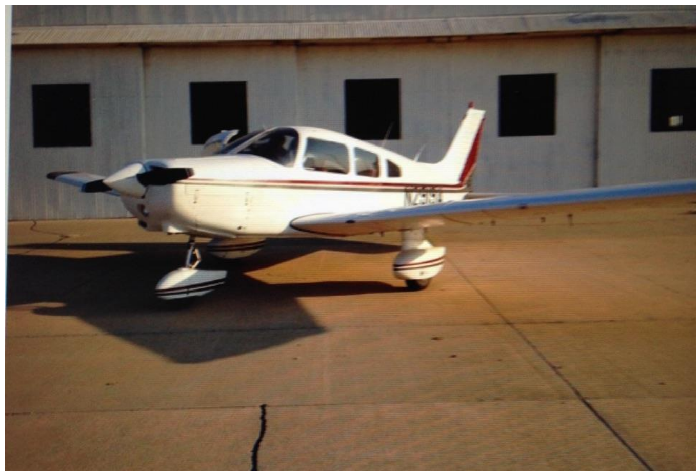
This plane is for sale. See next page for details.

If you know of a classified that is outdated, or want to submit a new one, please notify the newsletter guy.