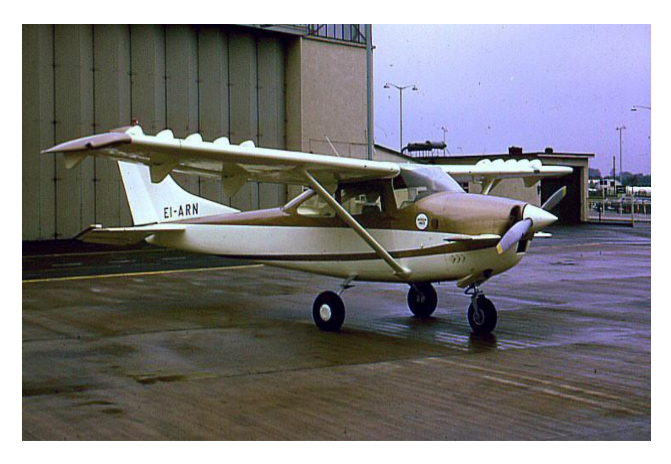
NAME THIS AIRCRAFT