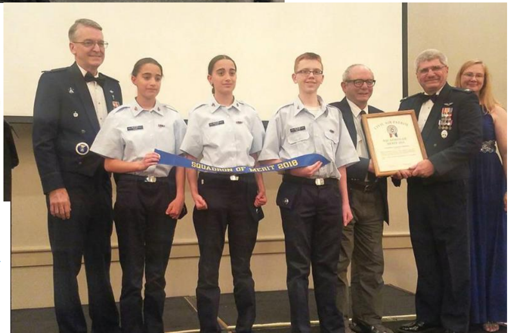
2018 Wing Squadron of Merit

(C) 717.253.3794 U.S. Air Force Auxiliary www.gettysburgcap.com www.GoCivilAirPatrol.com