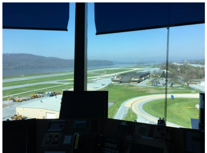
View from the MDT tower cab looking toward the turnpike bridge

STARS— S tandard T erminal A utomation R eplacement S ystem