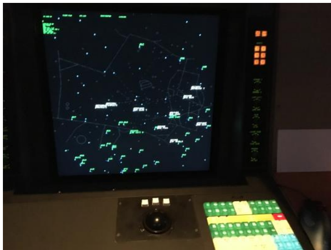
"STARS" at work. The radar sweep is gone the display is now digital