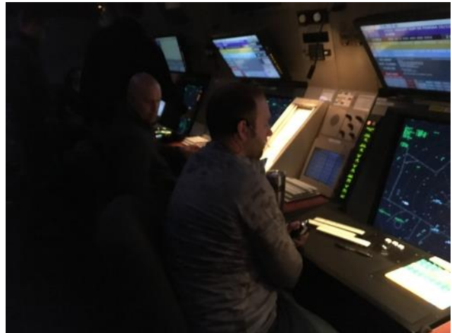
Harrisburg sector and Lancaster sector approach controllers at work