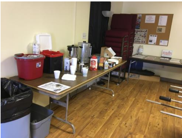
Light refreshments are served prior to every meeting

Additional Information on EAA Website Here: http://bit.ly/2DzNEaq