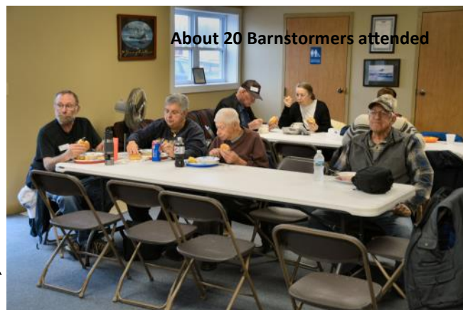
About 20 Barnstormers attended