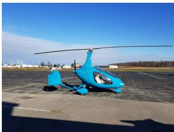
Bob and Savy flew to Bay Bridge (W29) airport and each took a Gyro familiarization ride