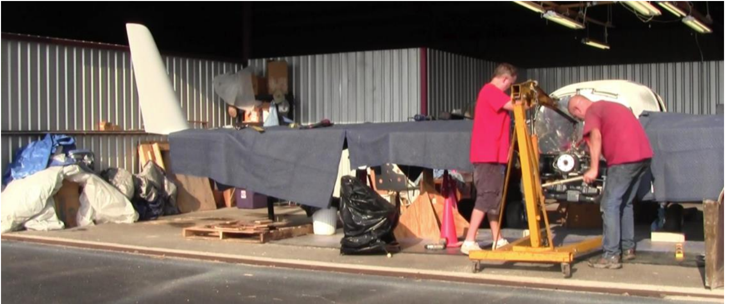
The joys of priming and sanding

"Sunrise, Sand, Fill, SunSet Repeat. Since February the work on my Velocity project has mirrored the Luke Bryan country hit 'Sunrise Sunburn Repeat". Wake up, sand, add some filler, sunset, wake up and do it all over gain. After 300 hours of that song I was able to shoot the first coat of primer. Then I moved on to mounting the engine.