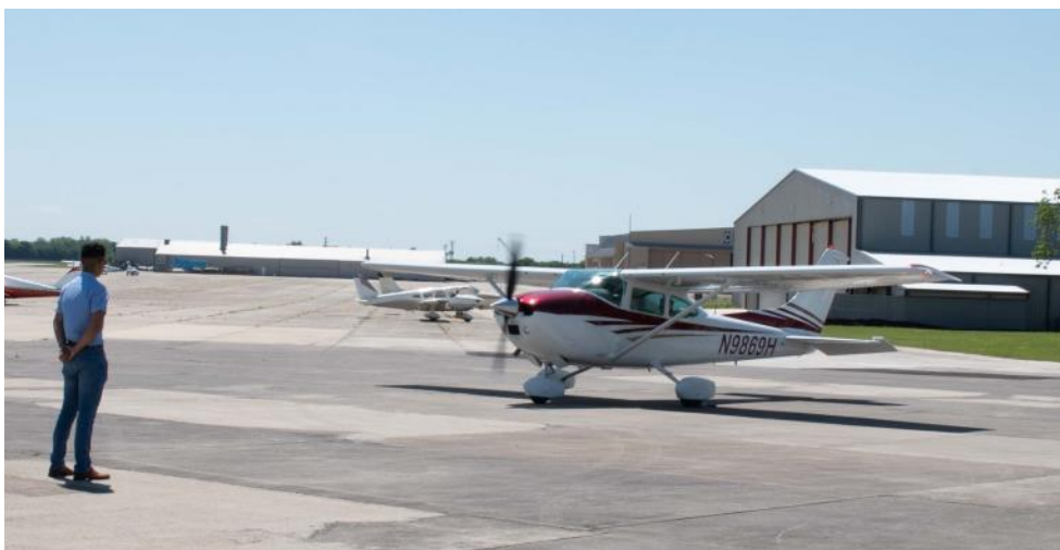
Angel Gonzales had a chance to practice marshaling the aircraft.