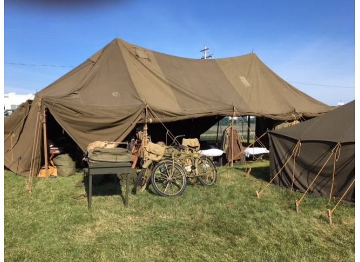
A recreation of a WWI encampment at the warbird area.