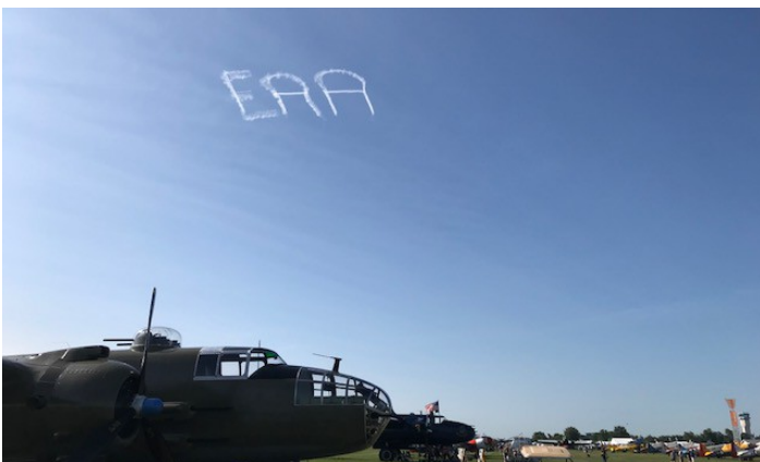
Welcome to Airventure