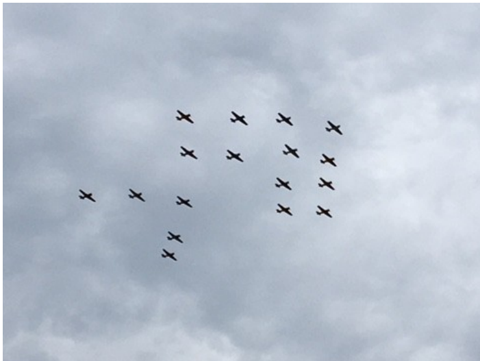
T-6 flyover during airshow