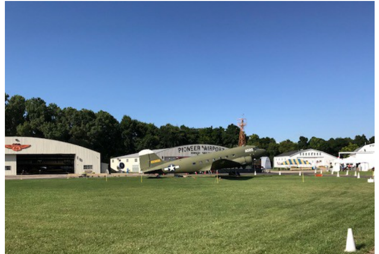
A C-47 parked at Pioneer Airport across from the Museum. Pioneer Airport is the site for helicopter rides, Kidventure, and hands on model aircraft flying.