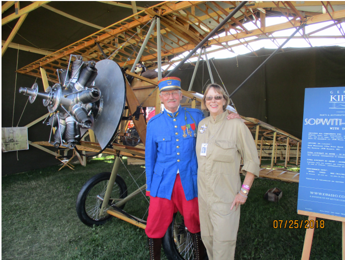
A replica Sopwith underconstruction – Check out that woodwork and engine!