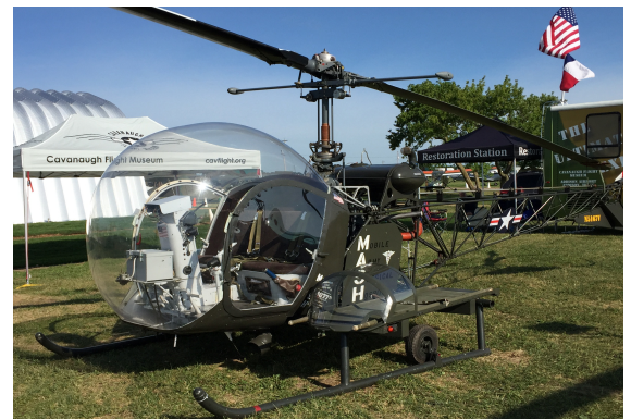
Bell 47-D-1 built in Niagara Falls, NY and seen in the opening scenes of the "MASH" series.