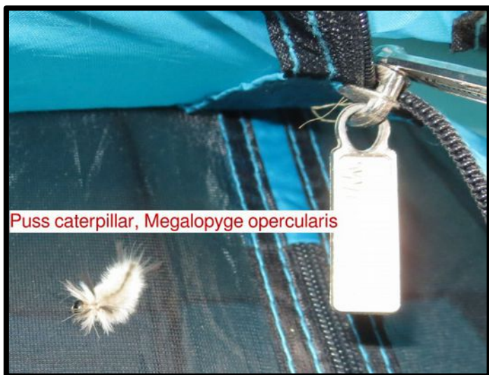
Puss caterpillar, Megalopyge opercularis

My wife is not as fascinated with airplanes as I am. She went back to camp site to take a nap. She called me away from flight line to deal with an attack on the tent. I researched it after we got home. It was a venomous Megalopyge opercularis .