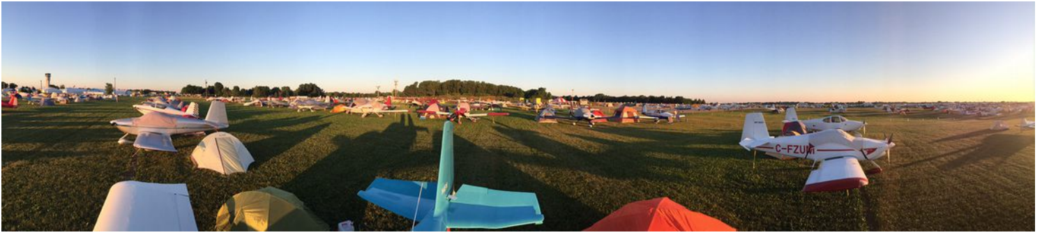
Panoramic view of Homebuilt Camping Row 308