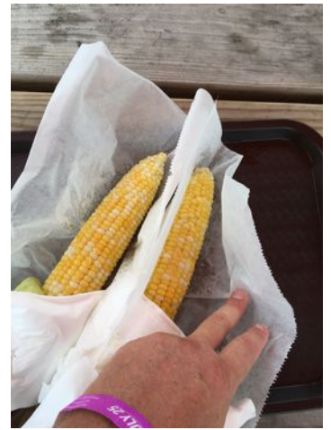
Favorite lunch – roasted Wisconsin sweet corn