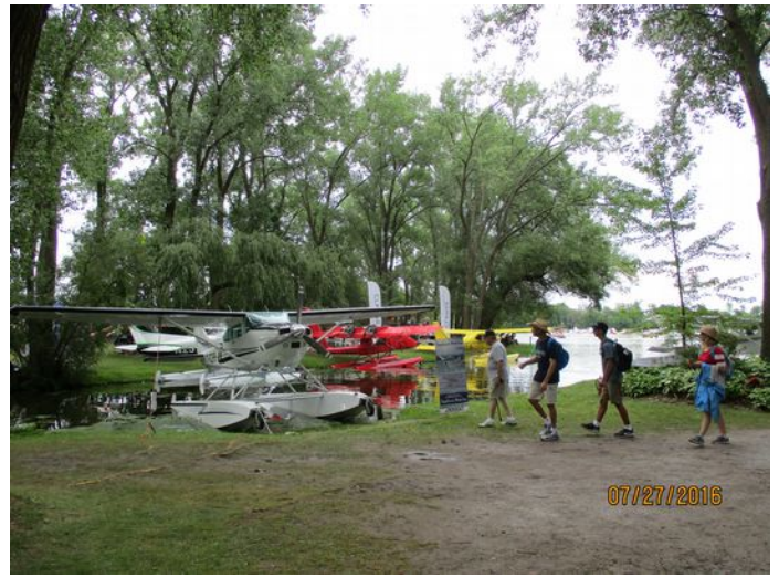
The seaplane base is always a great place to relax grab a snack and watch the float planes.