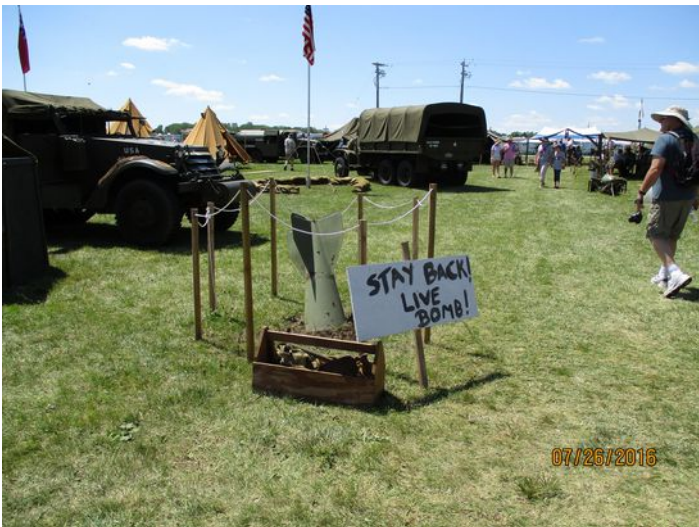
Bombing the Allies camp?