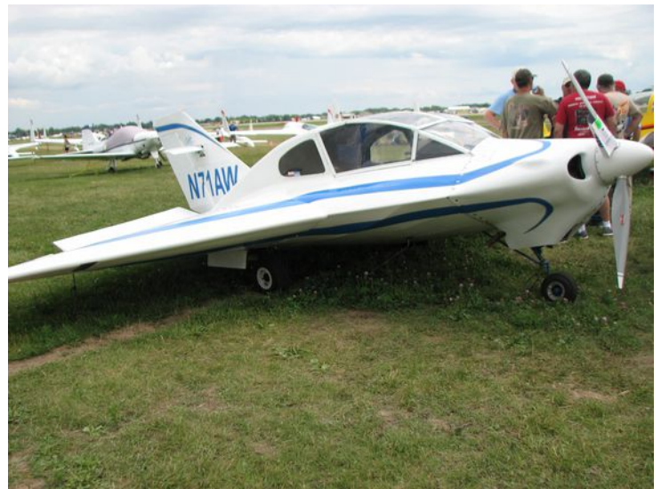
A rare Dykes Delta