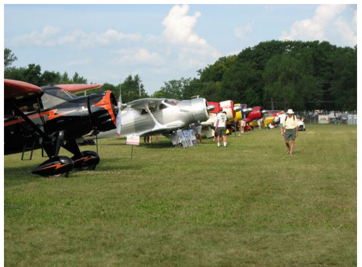
A gorgeous Stinson Reliant and fleet of Beech Staggerwings in the antique area