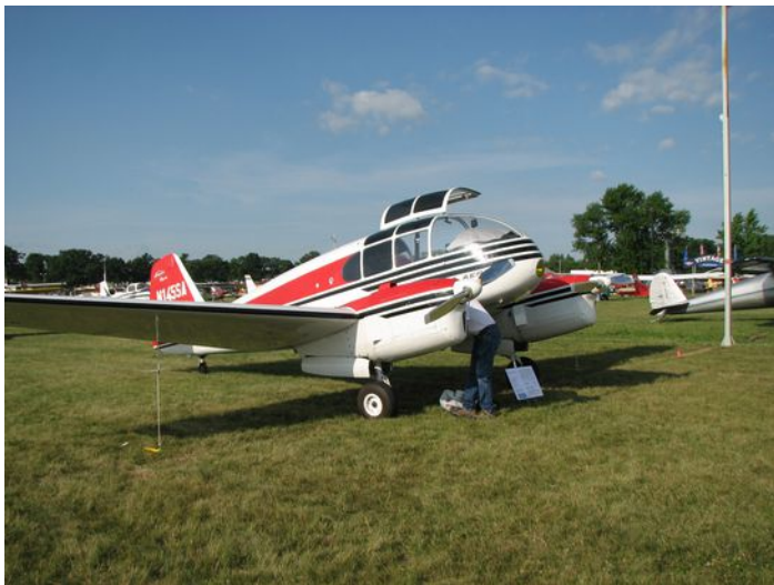
Also rare is this circa 1950's Czech Aero