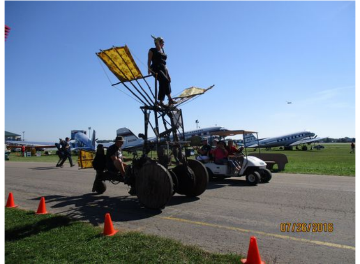
All kinds of "Flying?" machines