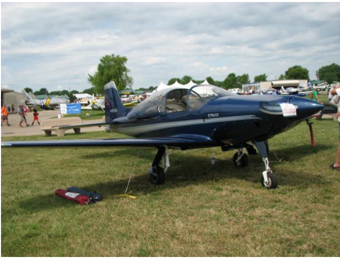
The sleek "all-wood" Falco