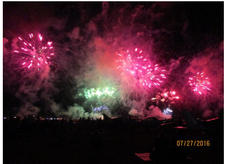
The night airshow and fireworks are unsurpassed.