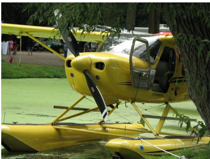
A beautiful Glastar on floats awaits inspection at the seaplane base