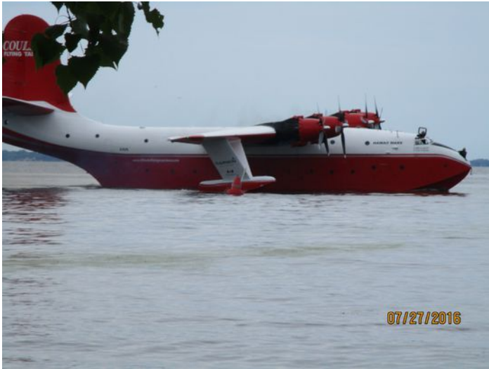
The Martin Mars put on a great show and dropped 7000 gallons of water in front of the flight line.