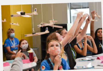
WEIGHT & BALANCE