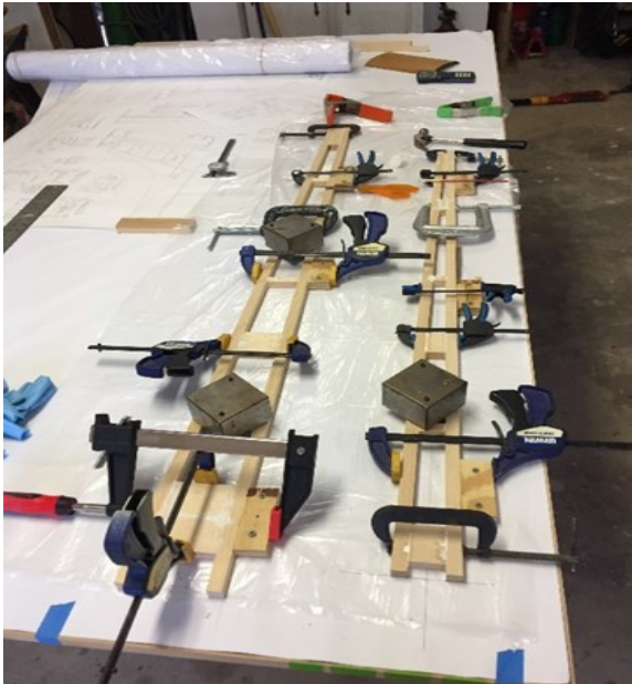
The first two Vertical Stabilizer formers being glued

The plane has a wood frame and is enclosed in a composite skin giving it a smooth and sleek appearance. (And I bleed too much when working with metal). That said, I have the tail feathers well underway and hope to have the fuselage frame in process by the end of April.