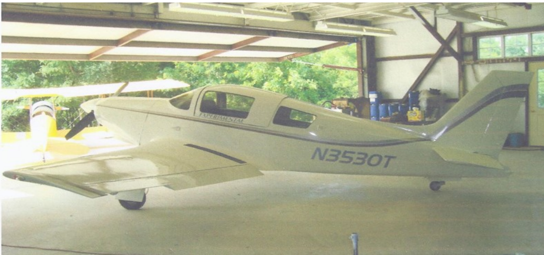
The Marathon will look something like this Celerity except with a fixed tri-gear.