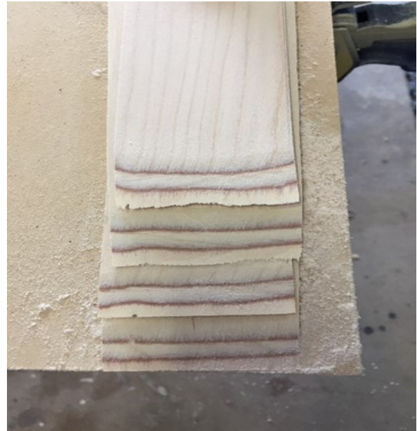
1.5mm former skins scarfed and ready to apply