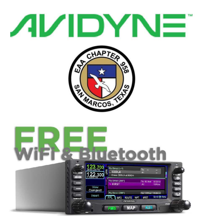
when you purchase an IFD440