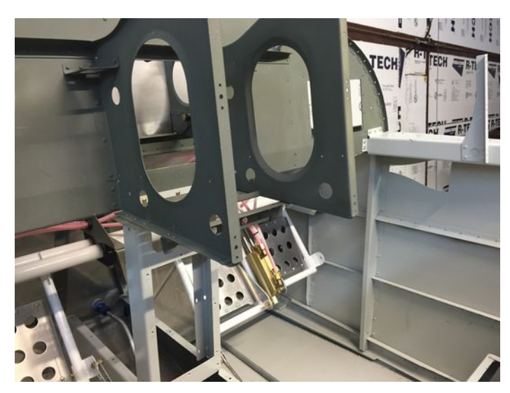
The official Newsletter of EAA Chapter 958, San Marcos, Texas