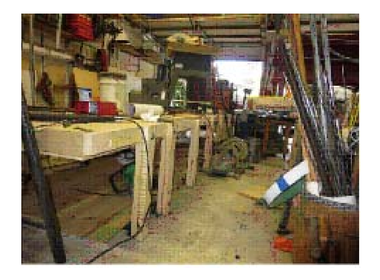
The 18 legs were attached using the internal nut plates.