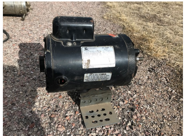
Emerson 2 HP Electric Motor, $20 Compare at $85