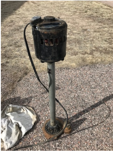
1/3 HP Electric Sump Pump, $50 Compare at $150