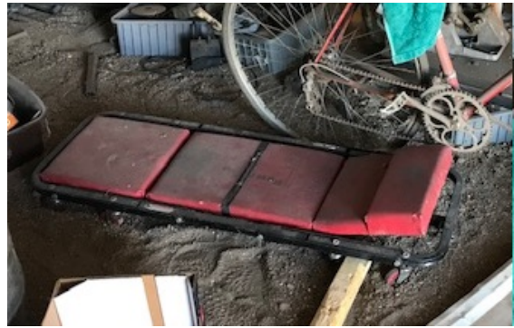
Adjustable Workshop creeper, $20 Compare at $50