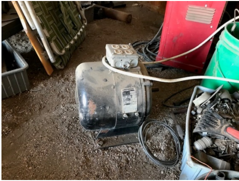
3500 Watt electric generator, $50 needs 5+ HP gasoline motor to drive it.