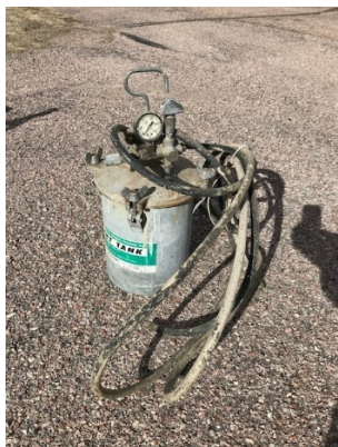
3-Gallon 60 psi Paint tank, $20 Compare at $50