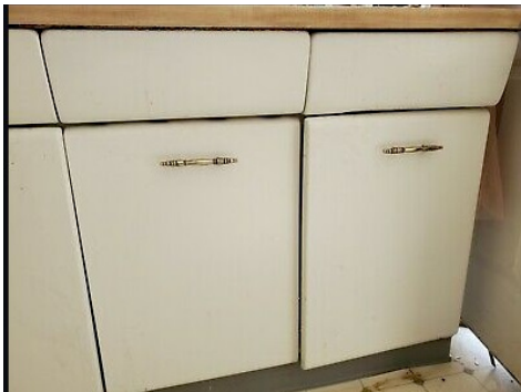
White Metal Counter/Cabinets, $5-$10 Similar to pictur