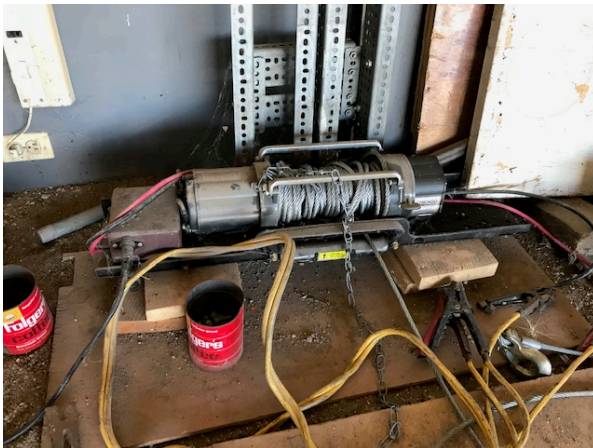
12 Volt Electric Winch, $30 Compare at $120