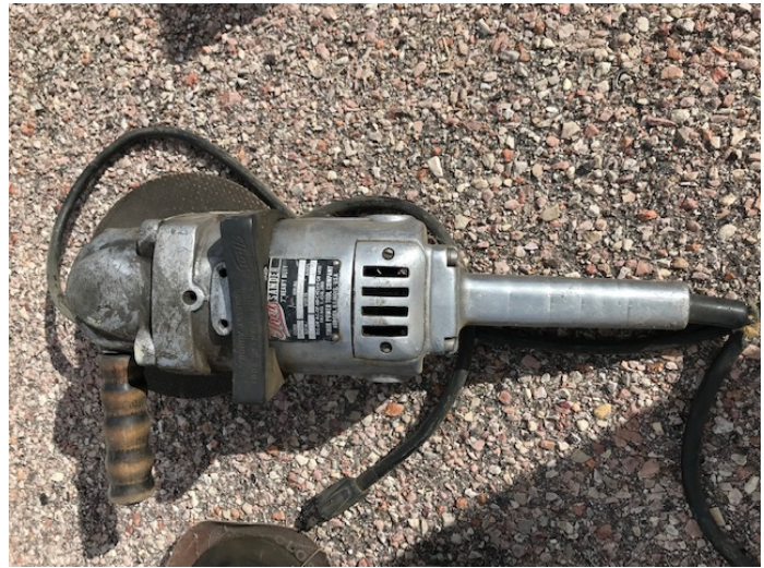
1200 Watt Industrial Quality Rotary Sander, $10 Needs new cord. Compare at $30