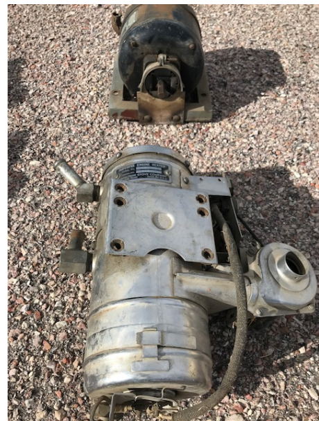
Gasoline-Powered Engine Pre-Warmer, $125 You can't find these anymore.