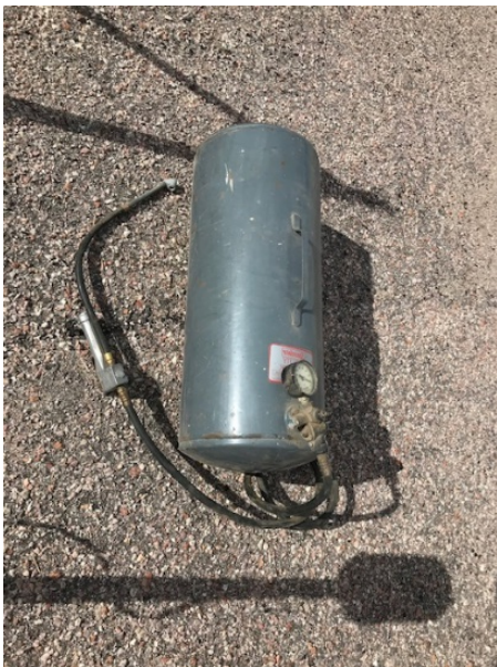
Portable Air tank with pressure gauge, $10 Compare at $30