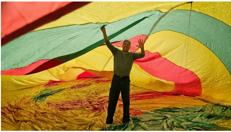
This is how to check in 'inside' of the balloon

of them) to check for cuts, burns, unusual wear patterns and chafing.