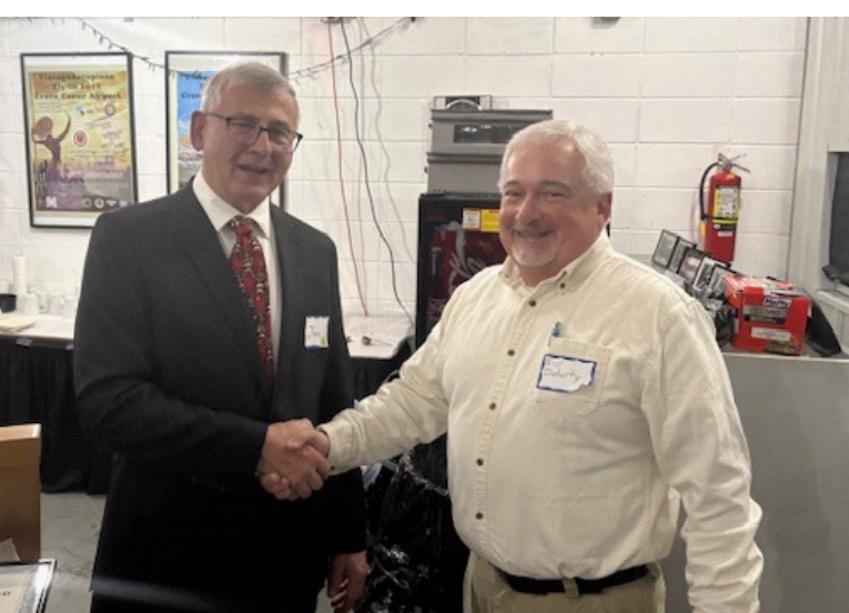
Transition of leadership at the Holiday Party

of them) to check for cuts, burns, unusual wear patterns and chafing.