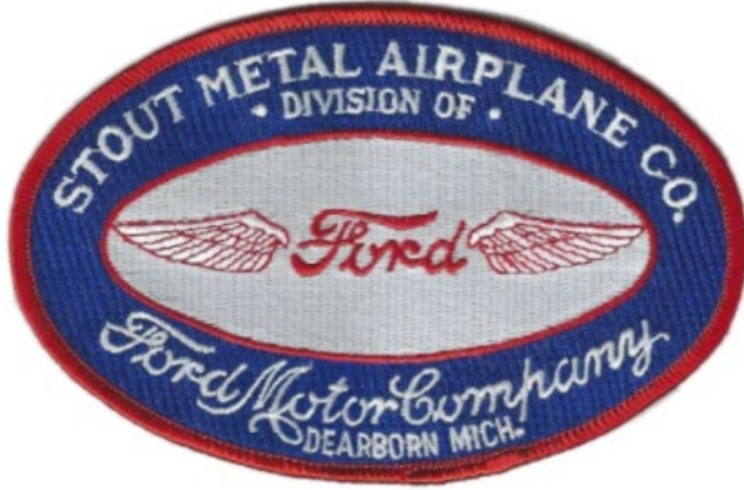
Stout Metal Airplane

company emblem.