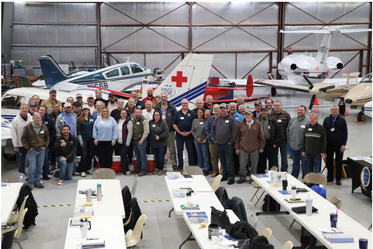
EAA Chapter Leadership Boot Camp March 8, 2025