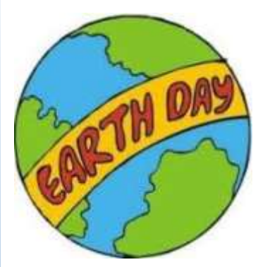
Friday, April 22 Earth Day 2016