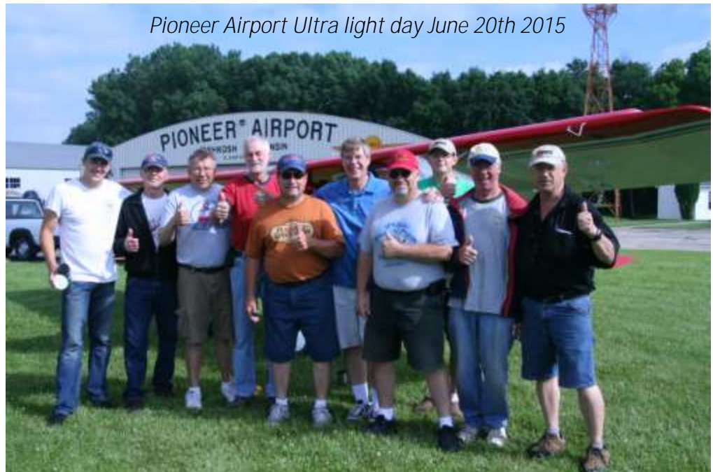
Pioneer Airport Ultra light day June 20th 2015