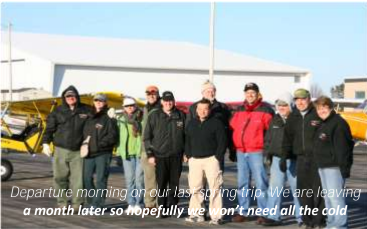
Departure morning on our last spring trip. We are leaving a month later so hopefully we won't need all the cold

Anyone interested in being Hopefully we can return 6 to 7 NASA Space Camp and a mu- trips that show some of the fun part of the Adventure to Pen- days later. The loose plan is to seum) and maybe a stop at we have! And just so every- sacola, FL we will have a get- make it down to Pensacola by Lafayette, Ga. to say high- body knows, the last picture together and planning session the end of day 2, tour the Navy the folks that befriended us on was staged.....a little. after the Chapter meeting at Museum on day 3, start home a previous trip to Florida. Other (honest!) Stevens Point. Planned depart- on day 4 with a possible stop at ideas are welcome. Here are some pictures from previous ture date is Saturday, May 16. Moontown, AL (home of the some pictures from previous