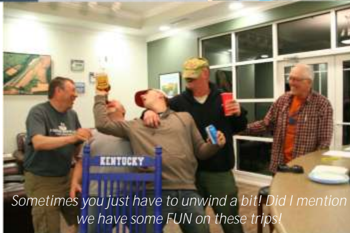
Sometimes you just have to unwind a bit! Did I mention we have some FUN on these trips!