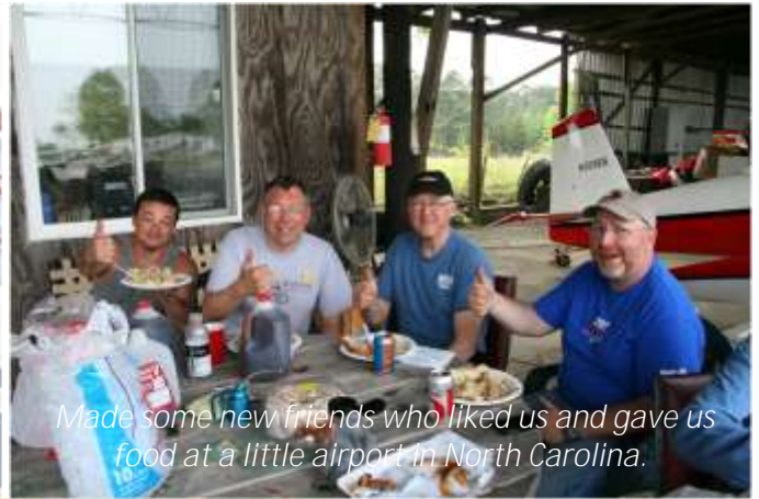
Made some new friends who liked us and gave us food at a little airport in North Carolina.