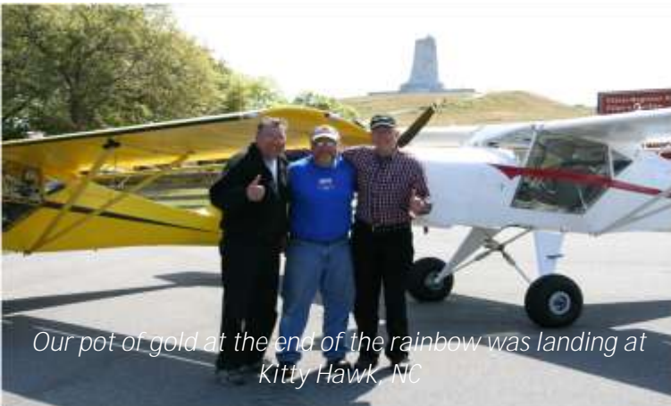
Our pot of gold at the end of the rainbow was landing at Kitty Hawk NC