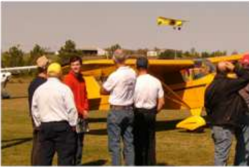
And finally, this is what the Peanut Gallery does at a fly-in –critical evaluations and advice.

Remember, Good judgment comes from experience and experience comes from bad judgment.