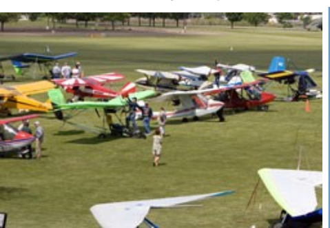
A variety of ultralights, including powered parachutes, trikes, and gliders joined several light-sport aircraft at EAA's annual Ultralight Day.