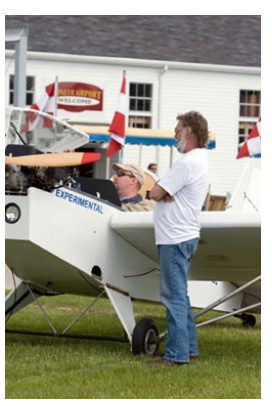
EAA ultralight chapter members watch the arrival of fellow Ultralight Day participants.

EAA Ultralight Day is held annually on Father's Day weekend at Pioneer Airport. Competitions and flight operations are organized and run by the participating