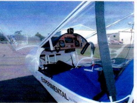
Aircraft is currently hangared in EGV.