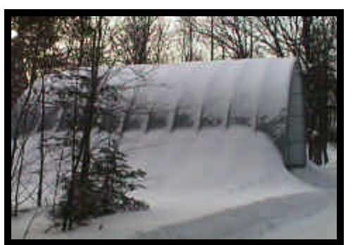
8 to 48 ft wide