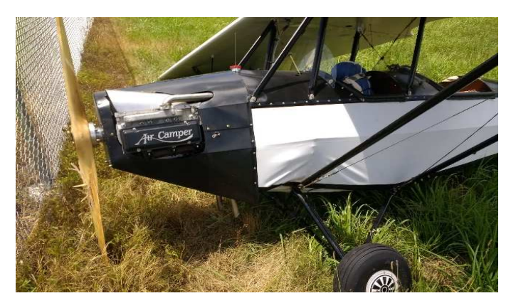
Pietenpol landed - Gear Up...

When I pancaked the plane into the ground fully stalled, the gear splayed outward by deforming the lower longerons inward. This collapsing structure effectively cushioned the impact, insulating me from the sudden stop. Had there been a passenger, their legroom would have been reduced.