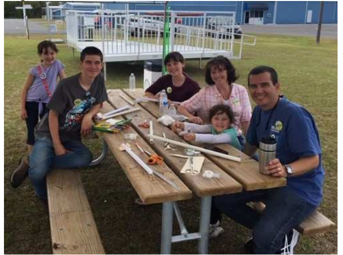
One group building "rockets" on Education Day

Aviation day earned some kudos from participants as they learned more about aviation and the resources available at their local airport. Students were ushered around nine different educational stations of knowledge and activities. Those with the correct guardianship for the releases got a free plane ride that included a brief explanation of pilot's duties and a pre-flight plane inspection.