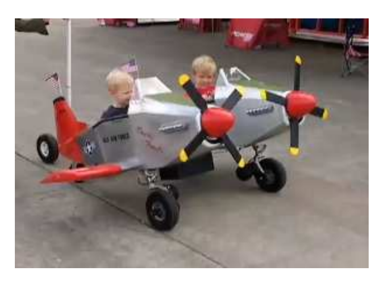
The XP-82 as imagined by youth

A Pancake Breakfast will be at 8:00 AM. All of our members are asked to share in the fun.