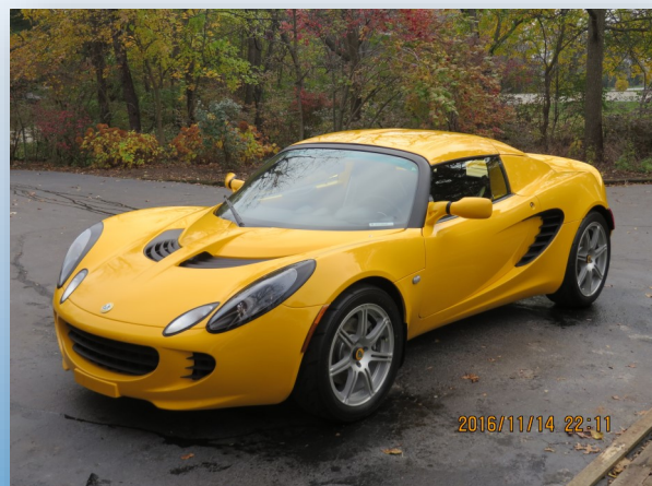
Figure 3 2005 Lotus Elise