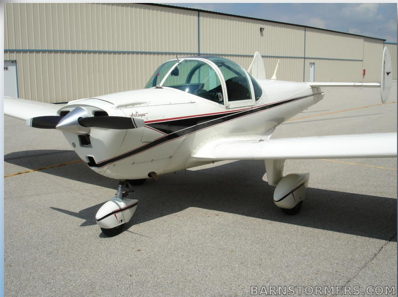
Figure 6 1968 Alon Coupe

And since we are discussing planes, the plane below is for sale out of DeKalb Airport. Ole and I are interested we just need two more people to be involved as partners.