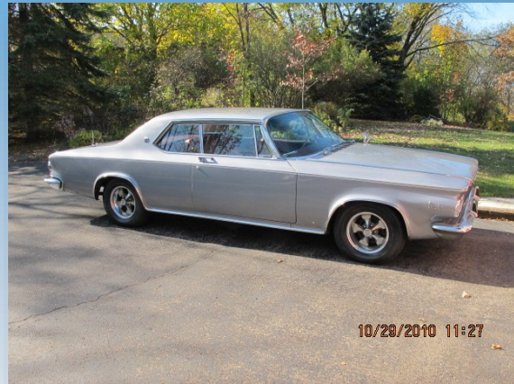
Figure 1 Chrysler 300 J Muscle car.

My number one passion is 'CARS', sorry fly guys. I own a Chrysler 300 J since 1967, one of 100 out of 400 made (not as rare as Ole's Prescott). The Miata is just a nice convertible to use for work on auto-cross events. It is similar to a J3 or Cessna 150, easy to work on and maintain. The Lotus Elise is my latest purchased vehicle (now to cross it off of my Bucket list). It has 7500 miles, one of the best handling cars in the world.