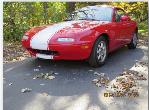
Figure 2 1997 Miata