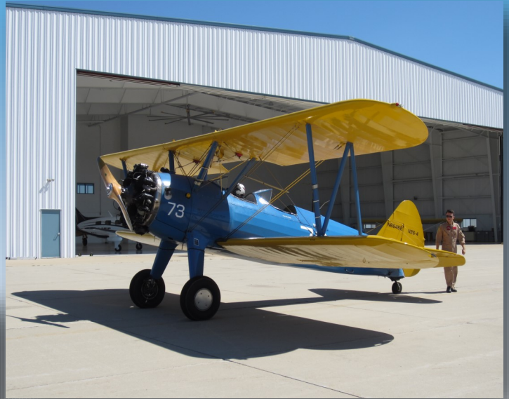
Figure 5 1943 Stearman

Three years ago my wife purchased a ticket for a flight in a Stearman, which I flu for 30 minutes. Got some 'stick' time doing wingovers. Was a fantastic flight!