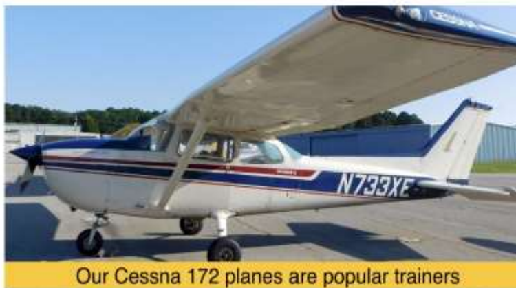
Our Cessna 172 planes are popular trainers

Founded in 2012 at Gwinnett County airport (LZU), the club now has over 60 members of all ages and backgrounds — from student pilots to certified flight instructors — to those who simply enjoy flying.