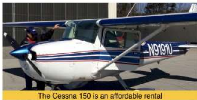
The Cessna 150 is an affordable rental

For more information on AeroVentures Club membership: