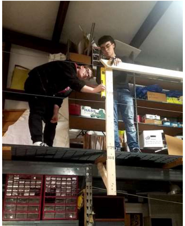
The security railing is almost complete. Getting is squared up is part of the learning process. Besides the two cables a top rail will be put in place for safety