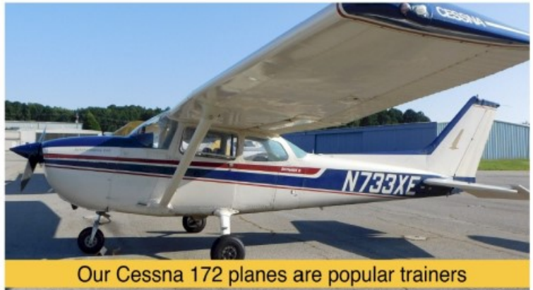
Our Cessna 172 planes are popular trainers

Founded in 2012 at Gwinnett County airport (LZU), the club now has over 60 members of all ages and backgrounds — from student pilots to certified flight instructors — to those who simply enjoy flying.