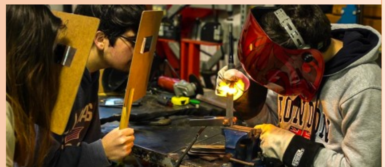
Welding practice in prep for the construction of the Frankenplane