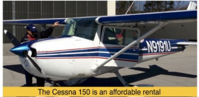
The Cessna 150 is an affordable rental

For more information on AeroVentures Club membership: