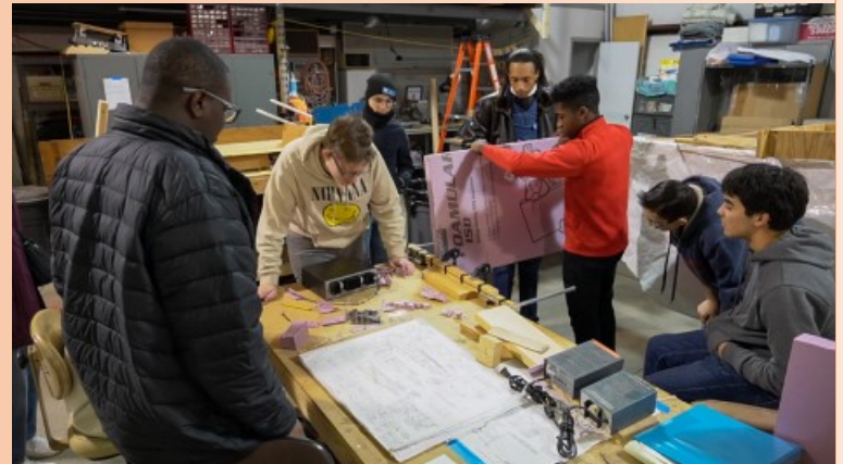
Building Youth practicing using the hot wire to cut foam for the Frankenplane horizontal stabi-