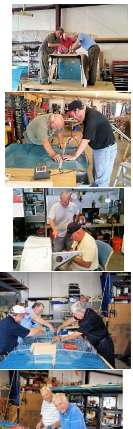
NavCom September 2017 Page 9