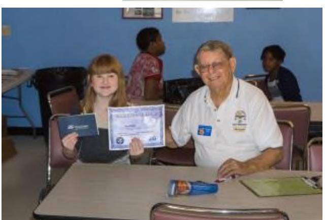
NavCom September 2017 Page 3