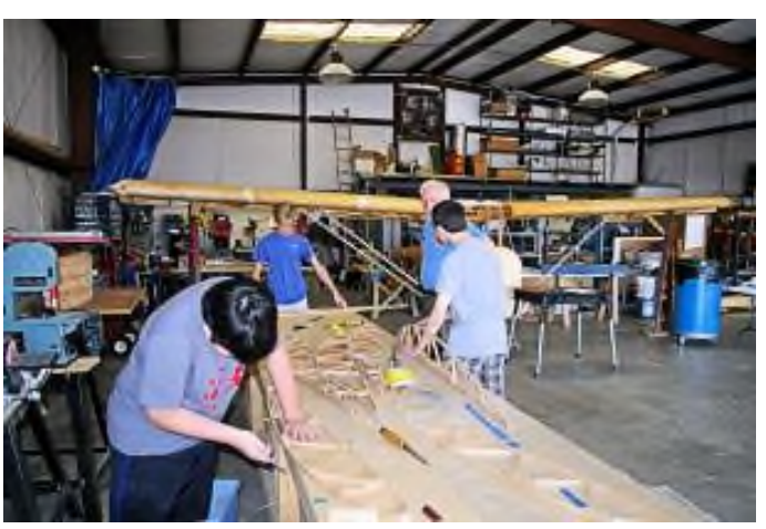
NavCom September 2017 Page 8