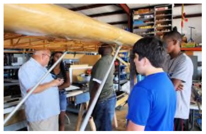
The struts are just about finished for the ultralite Piet. Next are the aileron control cables.

The 2-place Pietenpol - The ribs have been just about completed for the 2-place Pietenpol. The 2-place uses a flat wing unlike the ultralite which has 3-degrees of dihedral. Two, one piece spars will need to be made in the next step.