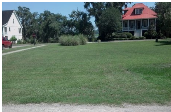
View from back entrance to large corner lot