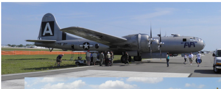
FIFI Rocks and Roars!!

Over all, a great time was had by all. Except for Forrest, see page 3.