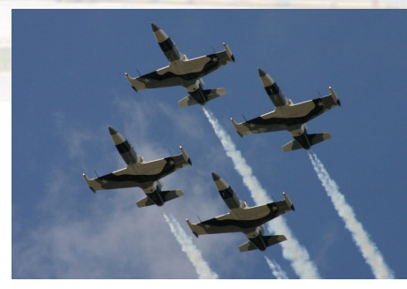
Heavy metal Jet Team