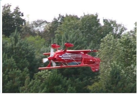
Buck Roetman's Eagle