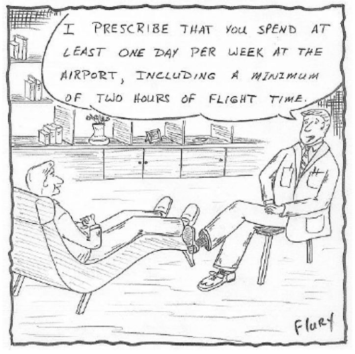
Health care reform that all pilots can believe in!

February 19-20 Annual Midwest Aviation Maintenance Symposium and Trade Show, Airport Holiday Inn, Des Moines, Iowa