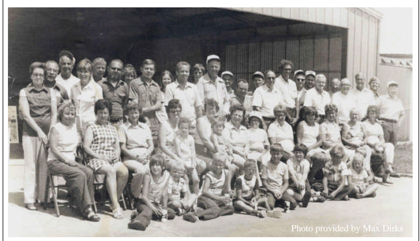
Chapter 33 Potluck Dinner, Monticello Iowa, 1977. How may members can you pick out?

After the Young Eagle flights we'll have a cookout with the Chapter supplying chips, burgers, hot dogs, and drinks. Feel free to bring any other dishes or food to share, but most importantly just bring yourself (and your family, the more the merrier). After lunch there should be plenty of opportunities for hangar flying and ride sharing. It should be a fun, low key meeting. Hope to see you there.