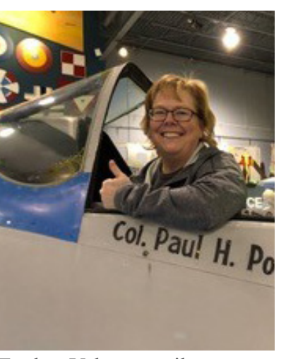
Eagles. Volunteer pilots gave 52 flights at this event.

Rally. We had lots of participation from members for both parts of the event and it included a nice mix of veteran volunteers and newer members, which is always nice to see. The weather was beautiful, and we had a number of planes fly in. The chapter turned a nice profit from the event, which is one of our major fundraisers of the year, but I think that the benefits extend far beyond the dollars raised. Members who volunteer and attend have another opportunity to spend time together. It provides great community outreach, and of course we have the chance to fly Young