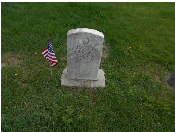
Bataan Death March, WWII Veteran.