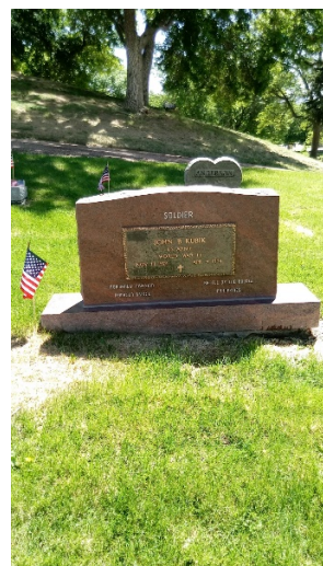
Served both theaters of WWII.