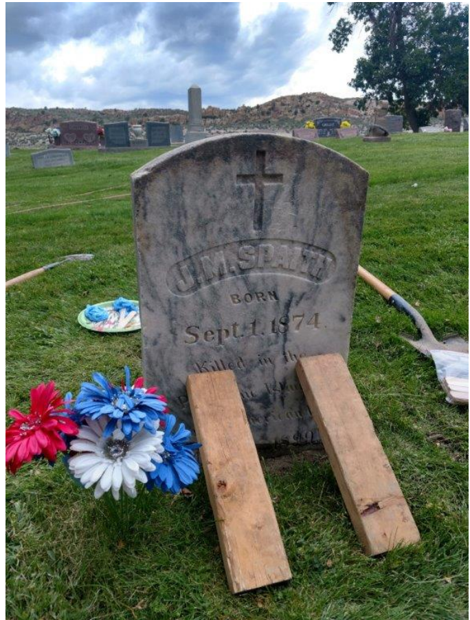
Spanish American War Veteran.