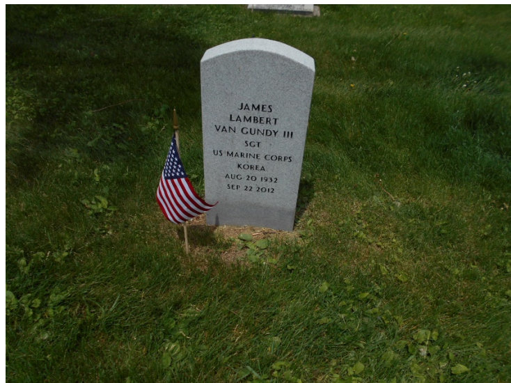
Korean War Veteran.