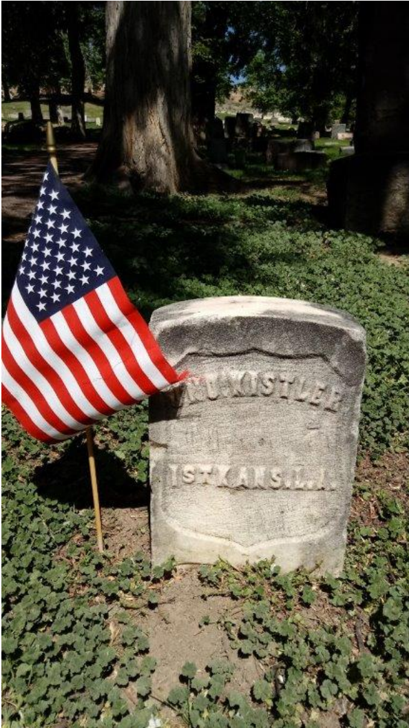
Civil War Veteran.