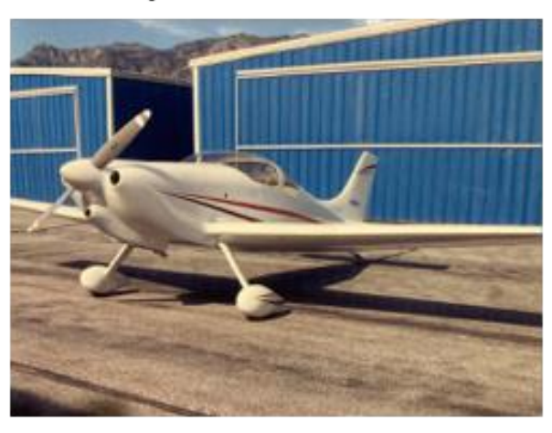
Example of a finished Marathon