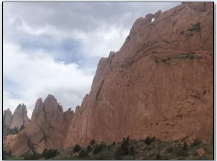
Garden of the Gods!