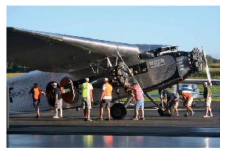
Chapter members get the Tri-Motor ready for a day of flying in 2019.