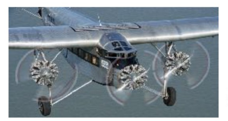
Liberty Aviation Museum's 1928 Ford Tri-Motor, 5-AT-B

Local Chapter 846 is based in Wadsworth, OH. For 38 years, its members have been sharing their love of flight and the aircraft that make it possible. The chapter is especially committed to fostering a love of aviation in the next generation of pilots by participating in EAA's Young Eagles. Through that program, volunteer EAA Chapter 846 members have given approximately 3,000 children the opportunity to experience their first flight. EAA Chapter 846 also awards scholarships to students who are interested in aviation and aviation careers or who want to participate in annual aviation camps offered by EAA. For more information on EAA and its programs, call (800-564-6322) or go to www.eaa.org and for the chapter check out its website <a href="http://www.846.eaachapter.org/">http://www.846.eaachapter.org/</a>. For continual news updates, connect with <a href="http://www.twitter.com/EAAupdate">www.twitter.com/EAAupdate</a>.