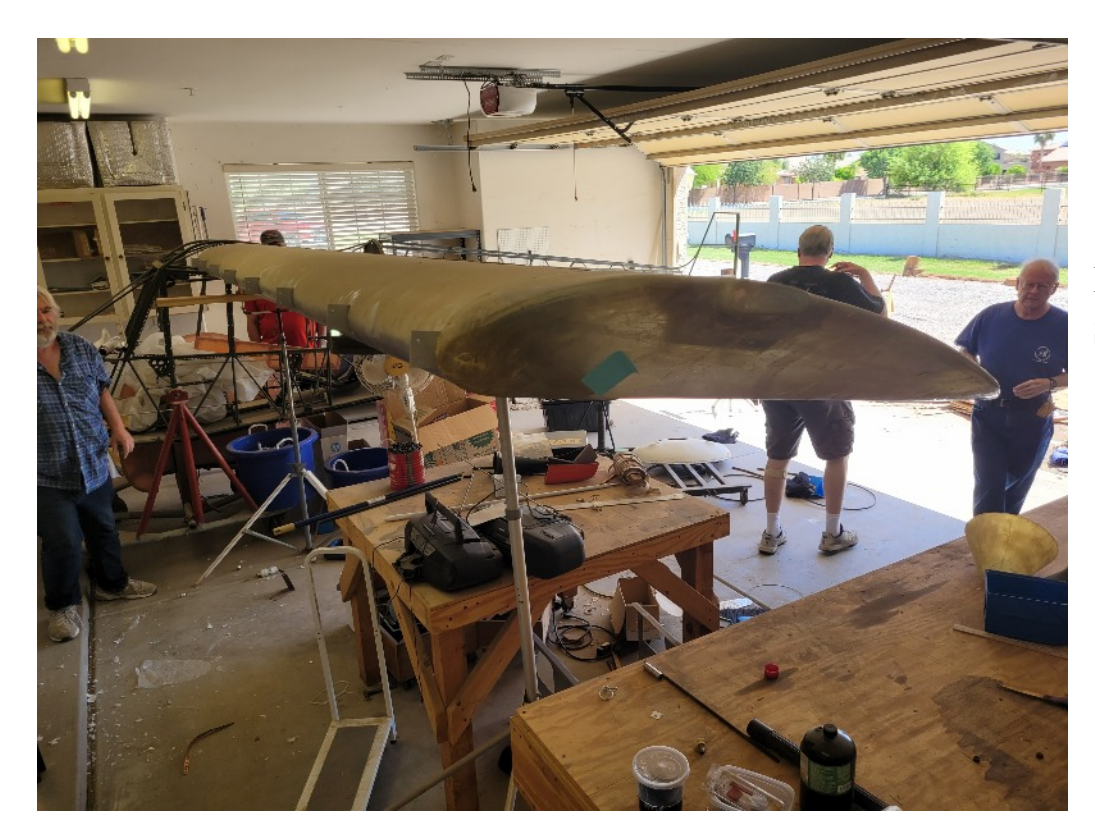
For Sale Project: Stol King